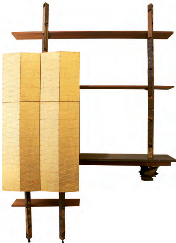
Rare and important steel sculpture by Paul Evans, 1964.